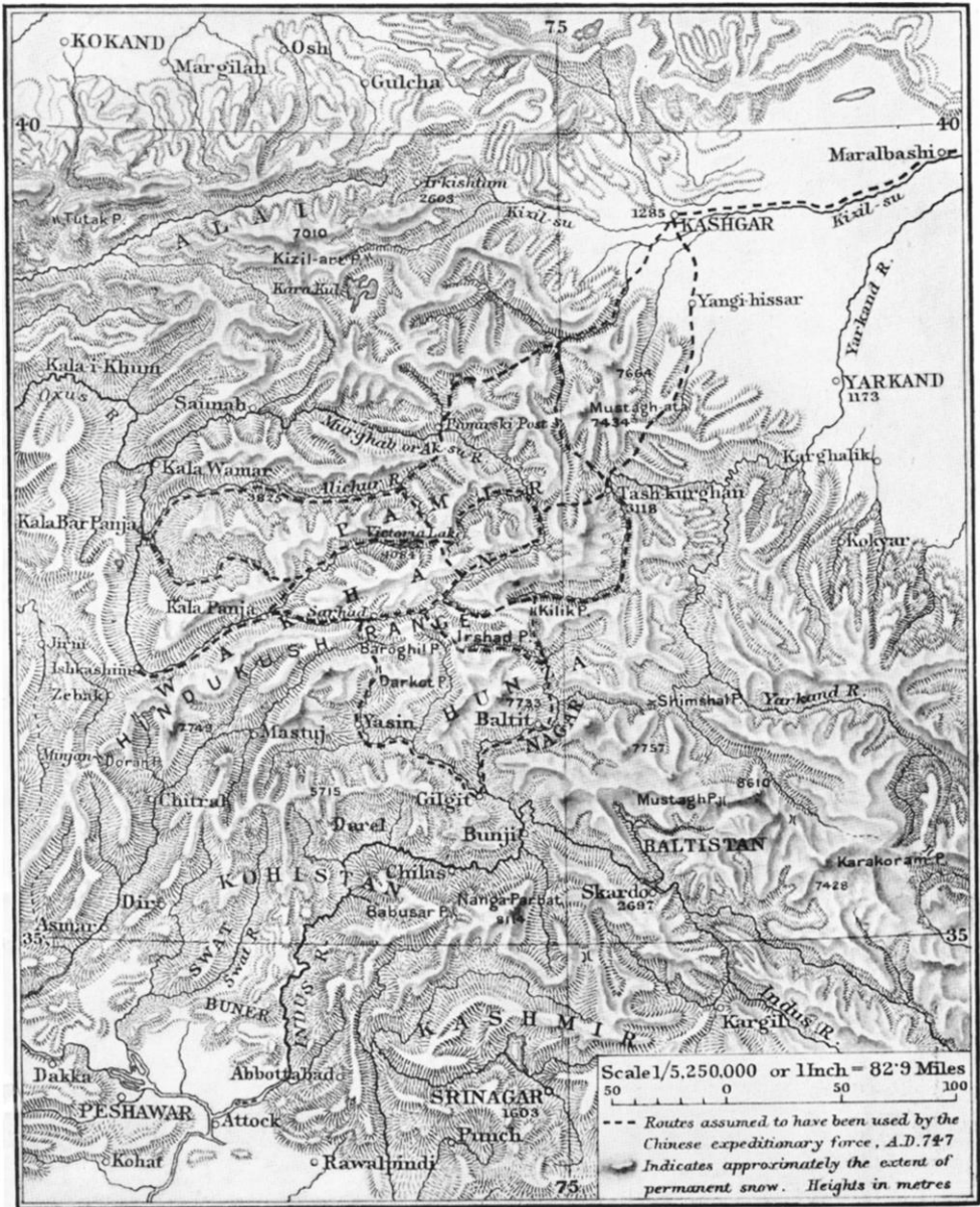
1. SKETCH-MAP OF MOUNTAIN COUNTRY BETWEEN THE WESTERN T'IENTHAN AND THE INDUS